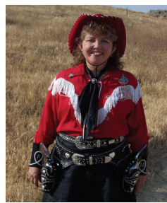
Fannie Mostly Ladies B Western