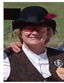
Pocket Change Ladies Silver Senior