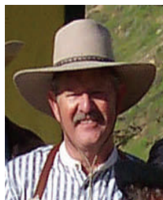
Snakebite Frontier Cartridge

It just goes to show the other clubs in California that you can NEVER underestimate our Regulators!