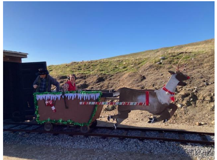
I wasn't kidding! Santa's sleigh!