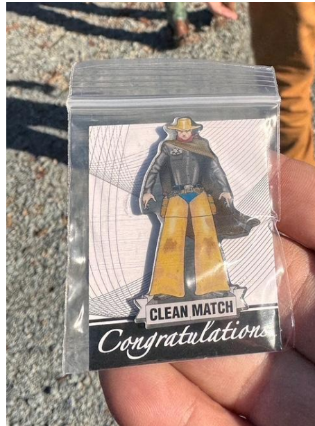
Here is the new KRR "Clean Match" pin