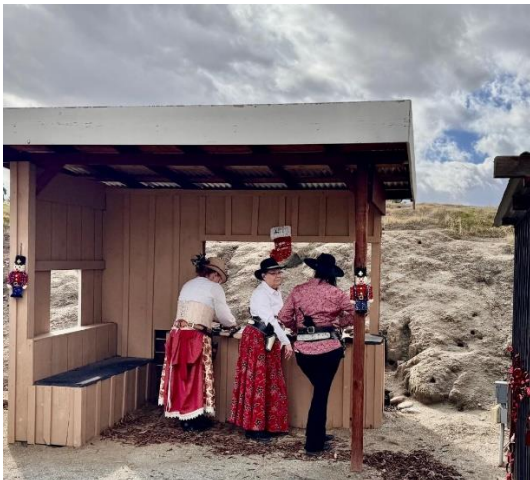
A few of our cowgirls in their holiday finery