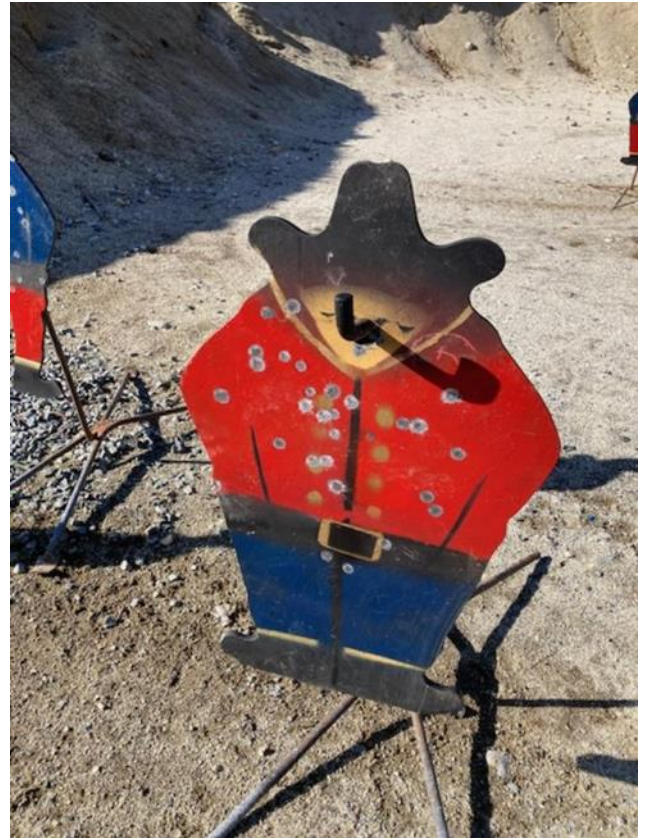
It was commented on that the Nutcrackers were all smoking cigars. Well, pipes anyway...