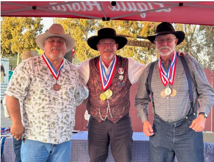
Senior: 1 st -Sinful, 2 nd -Dirty Hands, 3 rd -Liberty Outrider