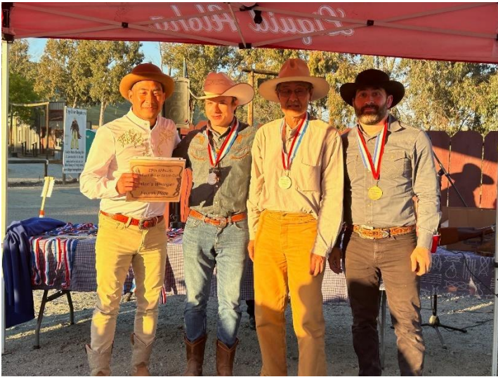
Wrangler: 1 st -Wilhelm Scream, 2 nd -Grubster, 3 rd -Danny Moon, 4 th -Ric O' Shay