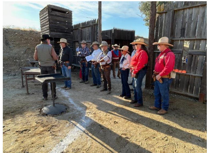
Cowboys & cowgirls getting the scoop on the next stage

In addition, there were plenty of category medalists, you can see their photos further on in this edition. Fort Miller has once again proven that it has the best shooters around. And the best looking! +++++