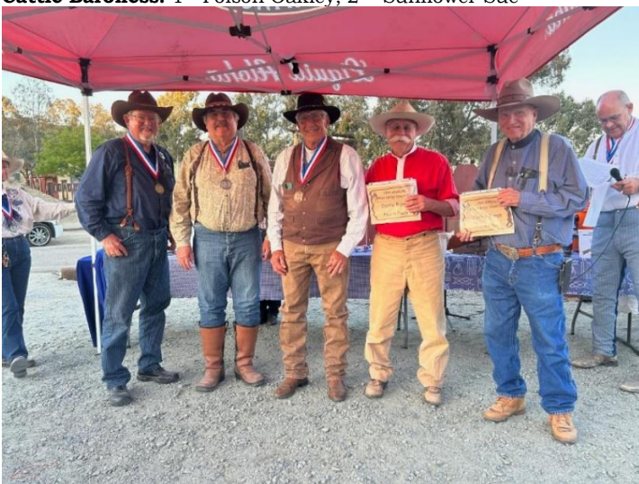
Cattle Baron: 1 st -Snakebite, 2 nd -Sam Ootie, 3 rd -Ruthless Rodg, 4 th -Warthog Red, 5 th -Sierra Rider