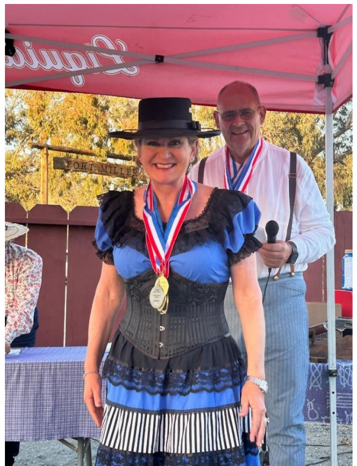
Lady Senior: 1 st -Miss Chievious