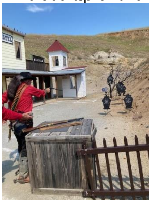
And here it is in action