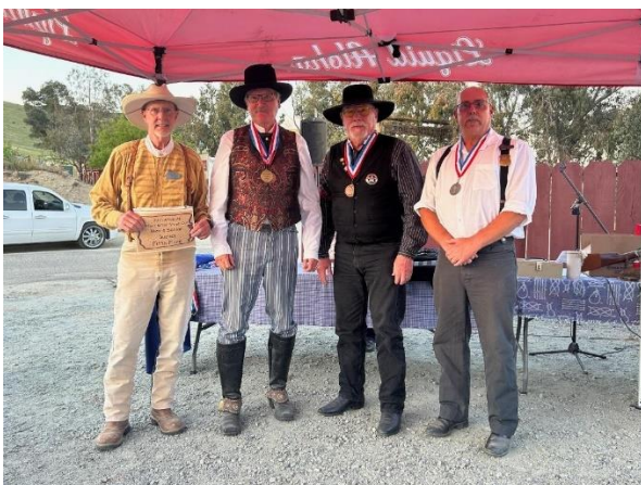
Senior Duelist: 1 st -Coaltrain, 2 nd -Jailer, 3 rd -Two Toe Bill Quickshot, 4 th -Pinebox Filler