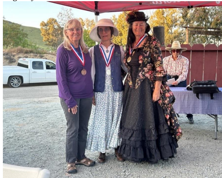
Grande Dame: 1 st -Lap Dog, 2 nd -Misti Q, 3 rd -Choo Choo