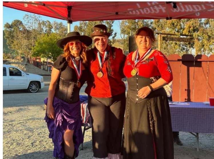
Lady Wrangler: 1 st -Hilde, 2 nd -Gunpowder 'N Grace, 3 rd -Bonny Kate(not pictured), 4 th -High Dollar