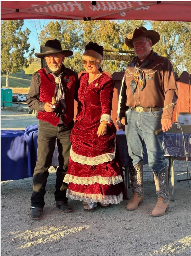
And finally Whistle Me Up Cowboy and his lady were the Best Dressed Lady and Gentleman