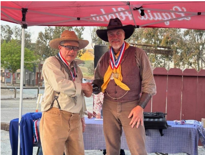
Gunfighter: 1 st -Molassas Moose, 2 nd -Whiskey T.F. Bottles(not pictured), 3 rd -Ol' Dollar