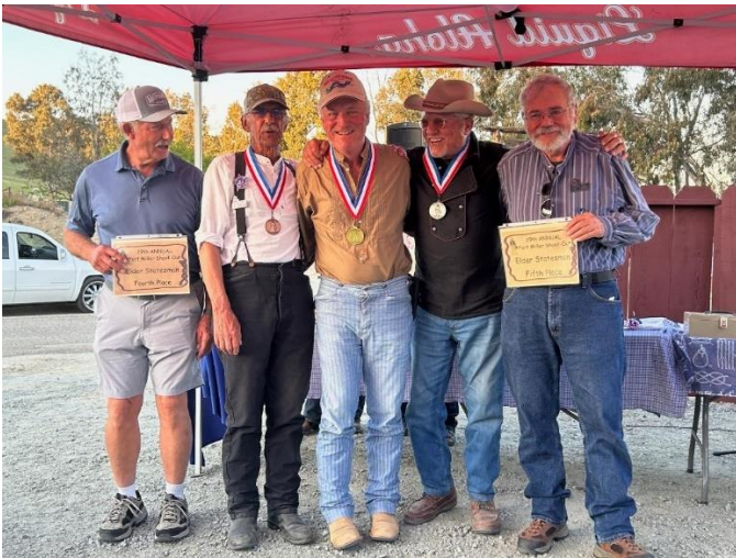
Elder Statesman: 1 st -El Lazo, 2 nd -Lightin' Bill Lightner, 3 rd -Yancey Derringer, 4 th -El Patron, 5 th -Hardpan Curmudgeon