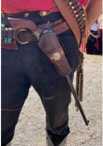
A close up of the Buntline

Talk about a hogleg!! And kudos to him, he used this Buntline Beast on several stages. Shatterhand had to use both hands to re-holster it. Awesome cowboy!!