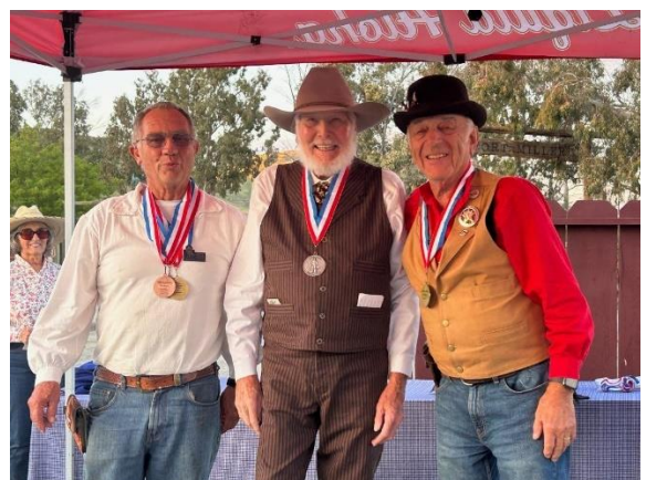
El Patron: 1 st -Roger Rapid, 2 nd -Utah Blaine, 3 rd -One Eyed Smith