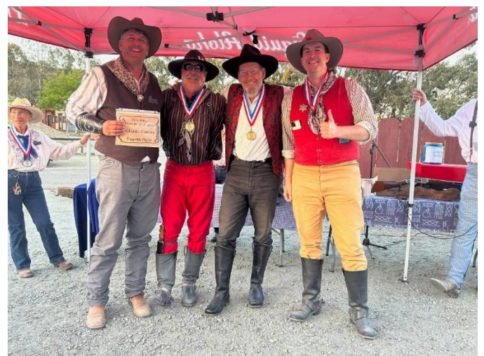
Classic Cowboy: 1 st -Ambs Aces, 2 nd -Tall Tale Todd, 3 rd -Shatterhand, 4 th -Dutch Longhorn